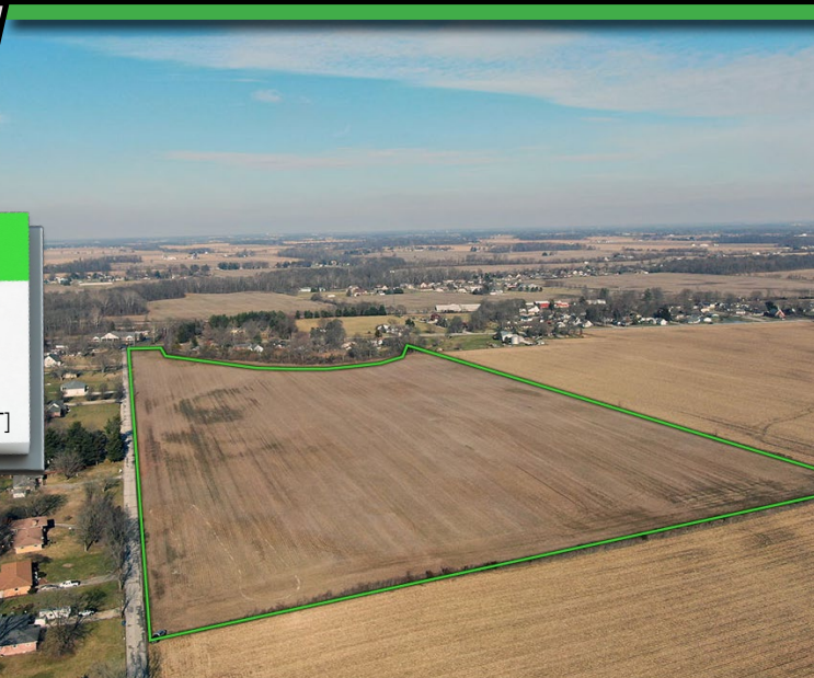
THE RUX-SRNKA FARM